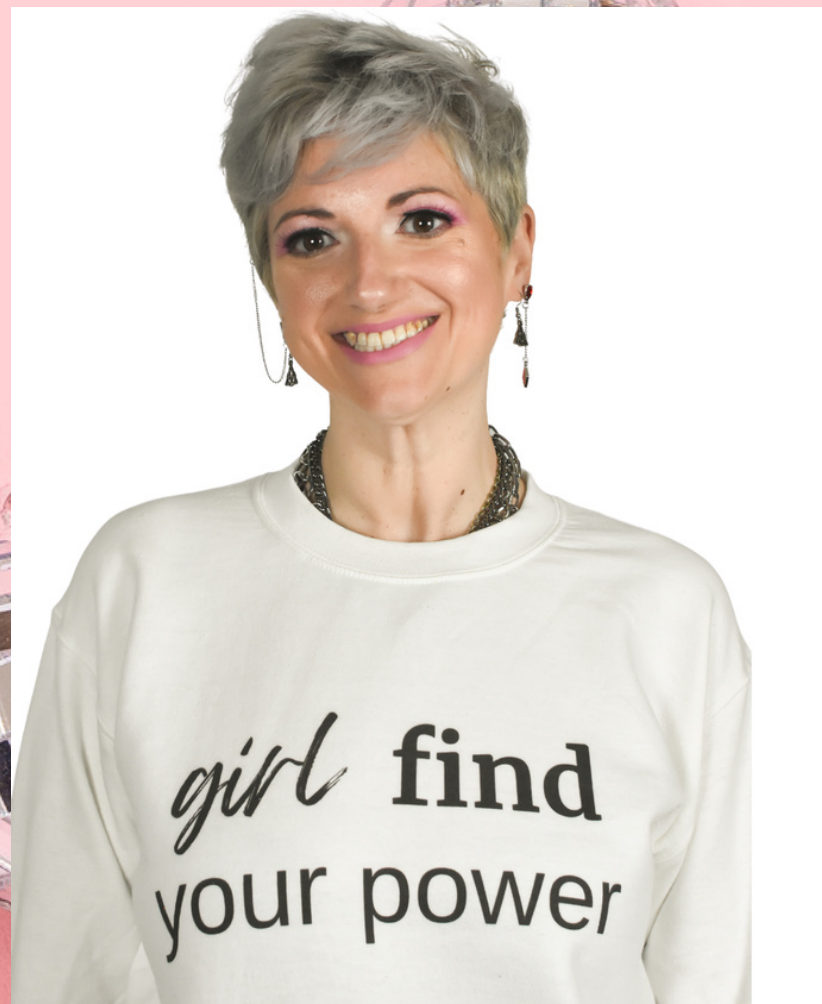
MENTAL HEALTH SERVICES

BE offers mental health services, career counseling and events to help women find their inner voice and truly live out the life they have always wanted to have. We understand that medical insurance can be expensive, confusing and certain plans do not get access to certain services. We at BE do not want women to not seek help because of their health insurance. We are here to help those without access to receive quality resources. Together, we can achieve success in whatever way you would like to see it happen.